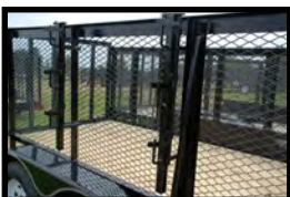
Weed Eater Racks