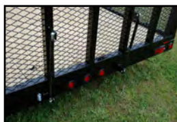
Gas Spring Assist on Ramp Gate