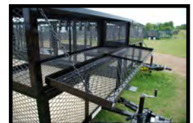
Removable /Lockable Landscape Box